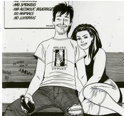
Original artwork for "Ray and Maggie Down at Leo's," Love and Rockets calendar, 1989.