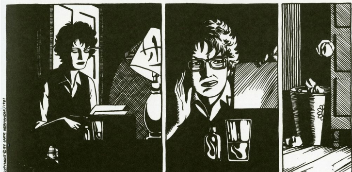
"How to Kill a ..." by Isabel Ruebens," splash page detail, Love and Rockets no. 1 (self-published, 1981).