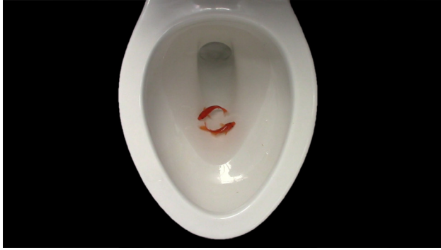
Katayoun Amjadi still shot from, It's the Fishes' Problem , 2019 HD Video 24 min., 2 sec.

For high resolution images contact Shelby Pasell at spasell@mcad.edu