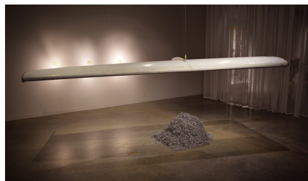
Nooshin Hakim Javadi Life is the aggregation of all moments of desire , 2017 Two identical airplane wings