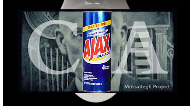
Katayoun Amjadi still shot from Letter to Baba , 2020 HD Video 9 min., 23 sec.