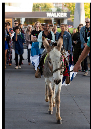
Nooshin Hakim Javadi Donkeyfull mind , 2019 Mulla nasruddin's Donkey